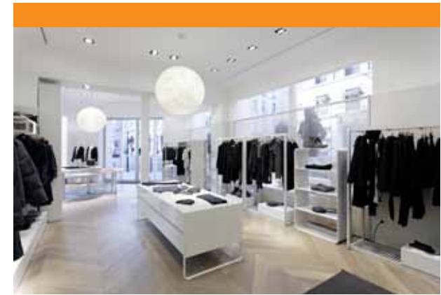
Comptoir des Cotonniers - Place St-Sulpice, Paris 280 m 2 . 6 weeks. 2010 Prime contractor: agence Virga