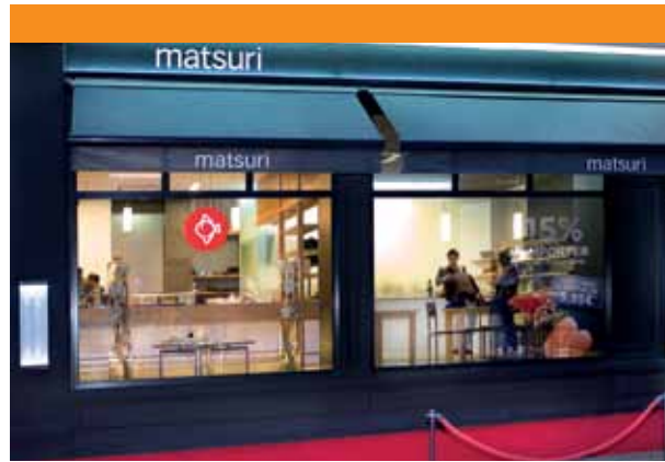
Matsuri - Saint-Etienne 400 m 2 . 4 months. 2011 Prime contractor: EZCT